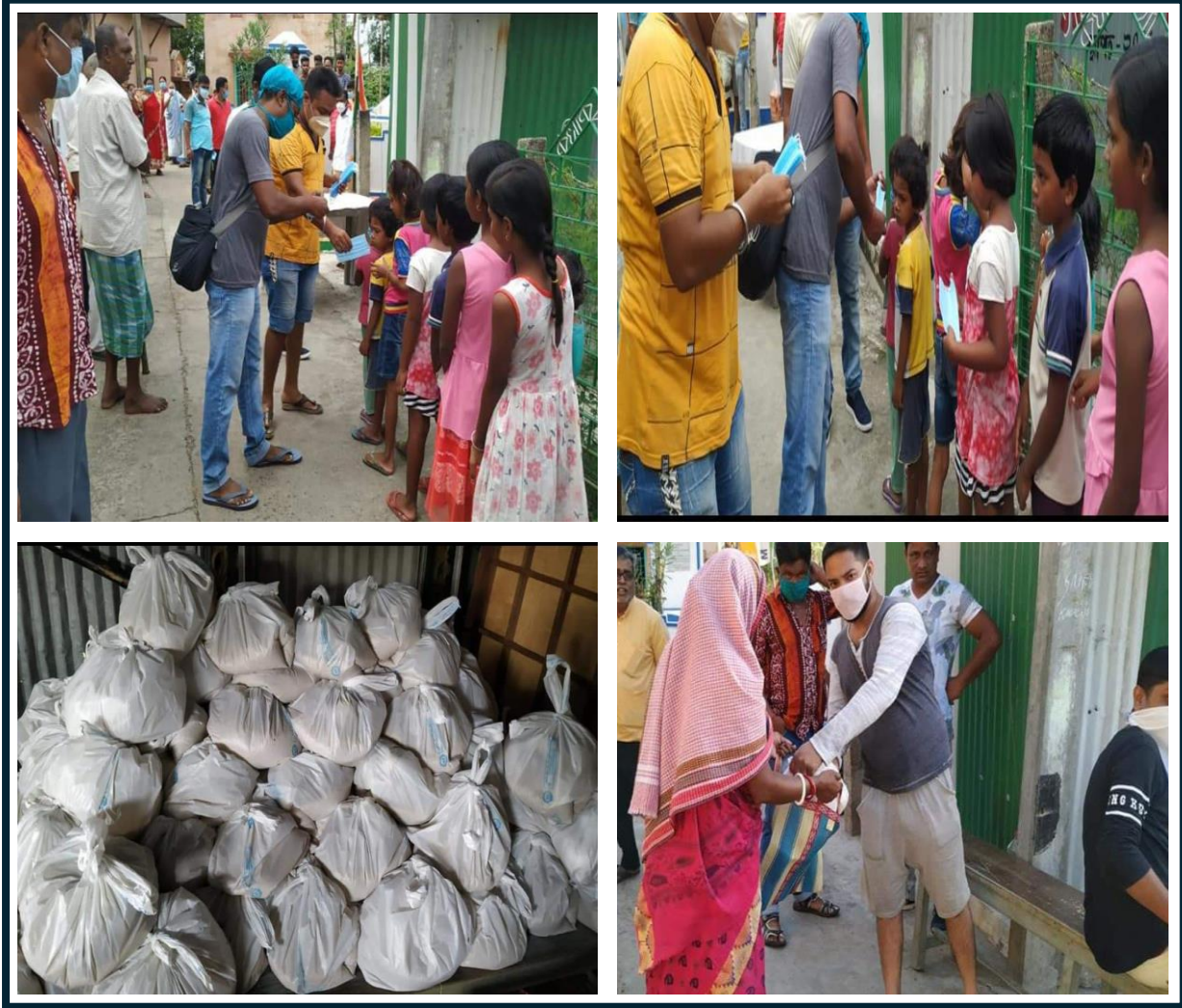
Photographs of Distribution During COVID-19 Pandemic