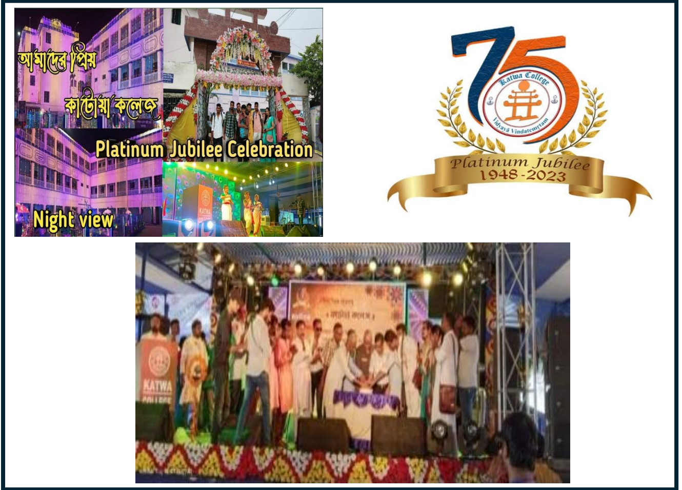
Photographs of 75 th years Celebration of College