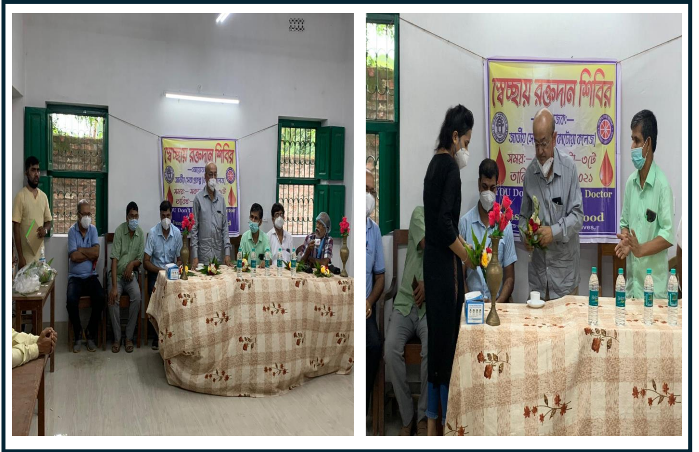
Sample Photographs of Blood Donation Camp