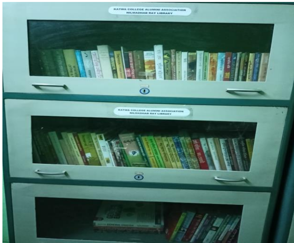
Photographs of Nilmadhab Ray Library