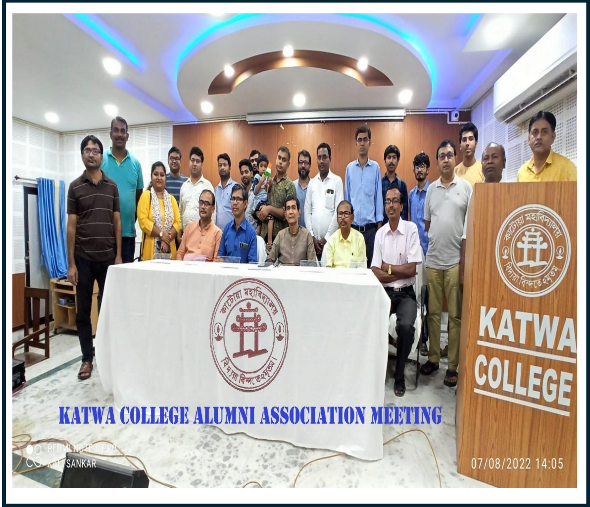
Photograph of Alumni Members